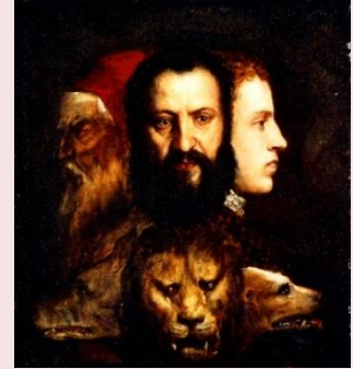
Allegory of Prudence, Titian