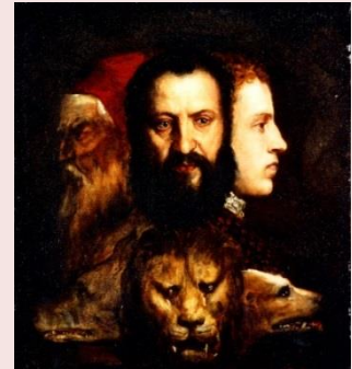
Allegory of Prudence, Titian