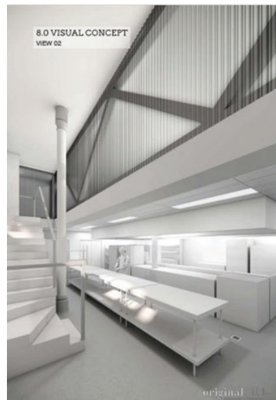
Visualisation of the refurbished kitchen