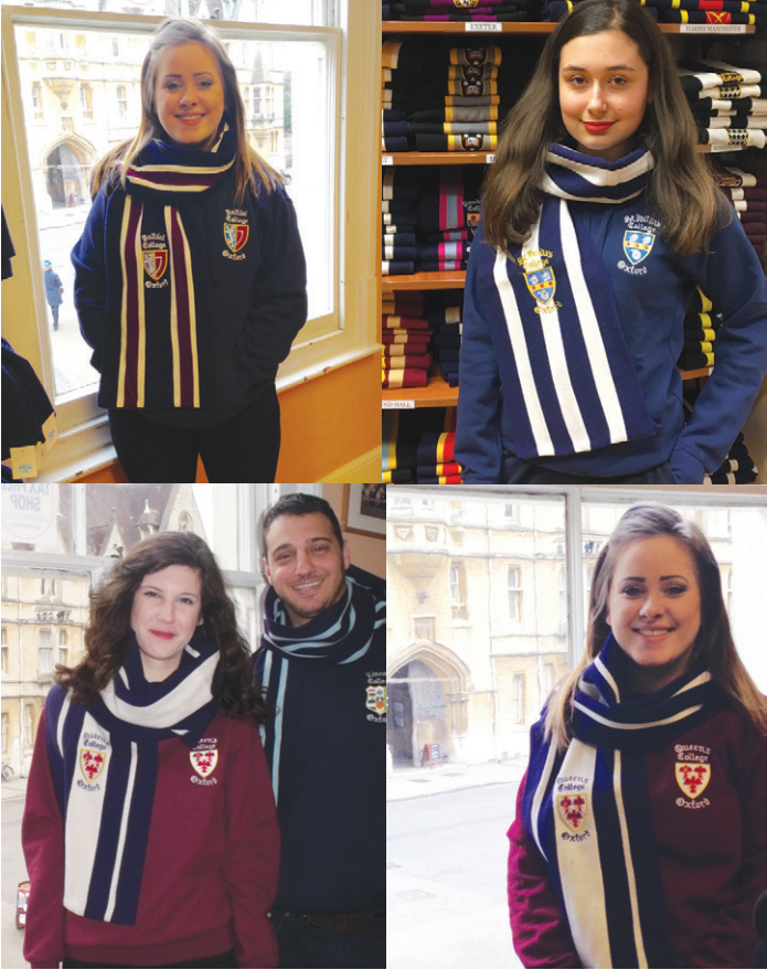
College Scarves + Hoodies